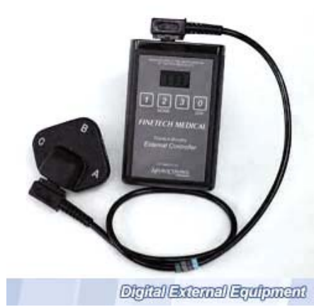
Digital External Equipment

Not all patients with spinal cord injury qualify for this implant system. Patients must have established skeletal maturity, because if the body is still growing, the electrodes may be displaced and the