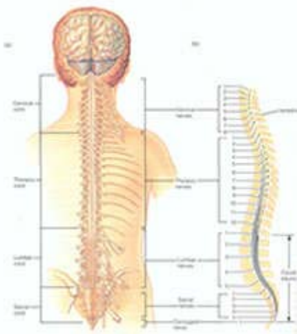
Figure 1 - Spinal cord showing the divisions and specific nerves coming out of each divisions

Until recently, the main consequences of spinal cord injury were confinement to a wheelchair and a lifetime of medical help. Treatment options for SCI used to be limited; the available care was highly unsatisfactory and frustrating due to its