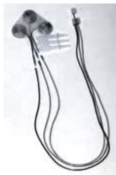
Implanted Receiver, Cables & Electrodes